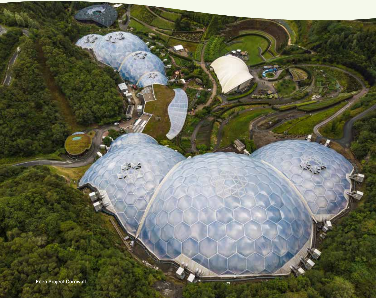
Eden Project Cornwall

Our gardens are showcases of the future in the present, they are the living landscapes on, and with which, we share our mission and narrative.