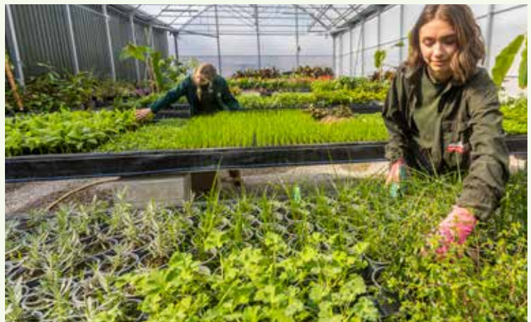
Growing Point Nursery